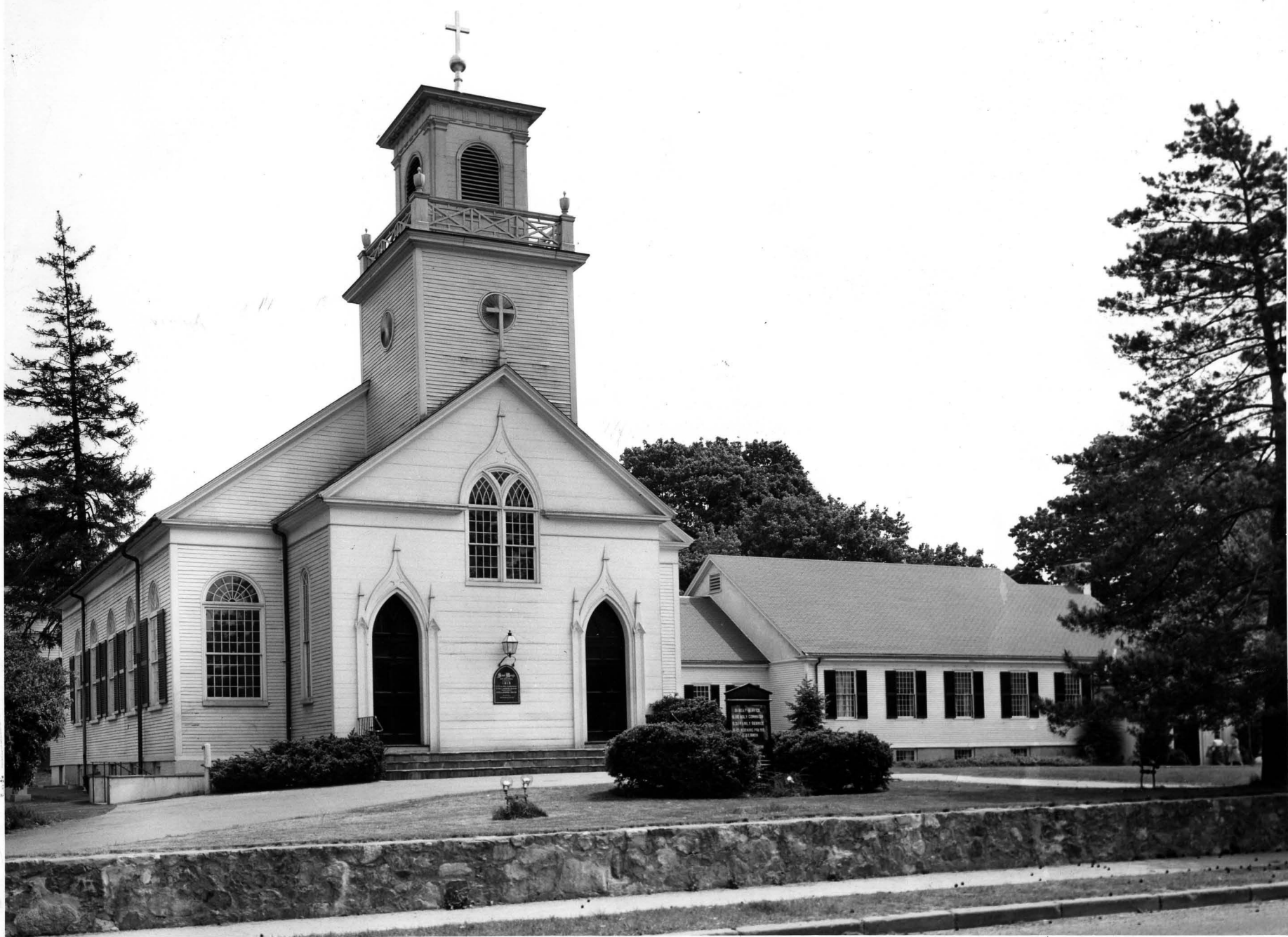
1. West and north facades of church; west facade of parish house. (Photograph: Robert W. Chalue, 1978)